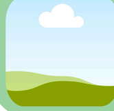
Vacant Area Assistant @socfc.org