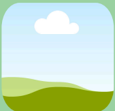
Vacant Site Manager (541) 621-3155 @socfc.org